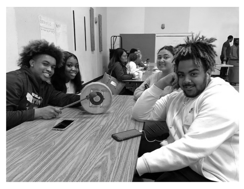
Student faciliators from the Community Feast and Conversation at Willow Lane.