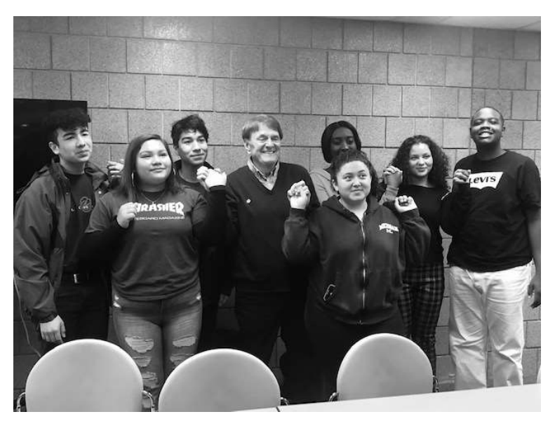
South Campus students meeting with Senator Wiger on November 12th.