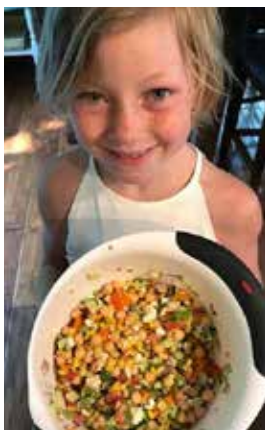
From the kitchen of Lucy F., Ellsworth, WI Serving size: 1 cup Serves: 10